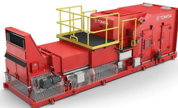
Figure 2: TOMRA COM 1200 XRT 2.0

TOMRA estimates that for a throughput of 1 million tonnes of feed ore and ~500kt/year of pre-concentrate, two XRT units (Figure 2) would be required.